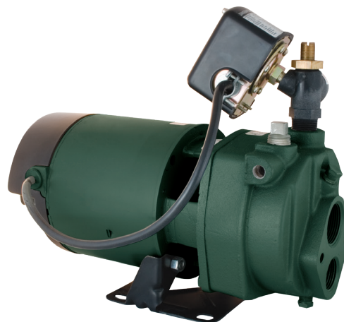
Convertible Jet Pumps with NEMA J adaptable uni-frame motor

NE462 - 1/2 HP 115/230 V 1-1/4" inlet, 3/4" discharge NE463 - 1 HP 115/230 V 1-1/4" inlet, 1" discharge