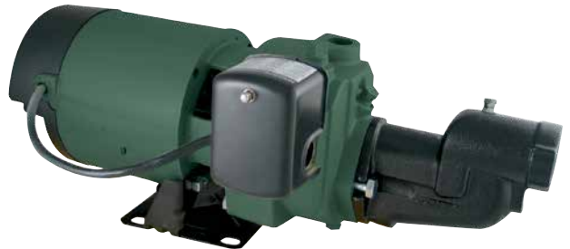
NE460 - 1/2 HP 115/230 V