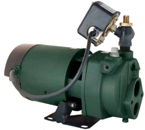
Convertible Jet Pumps with NEMA J adaptable uni-frame motor

NE462 - 1/2 HP 115/230 V 1-1/4" inlet, 3/4" discharge NE463 - 1 HP 115/230 V 1-1/4" inlet, 1" discharge