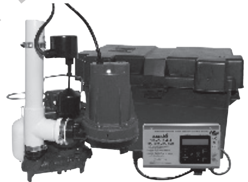
Primary pump not included. Product may not be exactly as shown. For preassembled systems, order a ProPak.