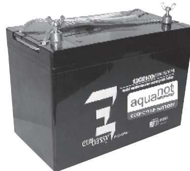
Aquanot® Deep-cycle Battery (purchase separately) P/N 10-1450 - AGM (shown) P/N 10-0761 - Wet

WARRANTY - 3 years from date of purchase.