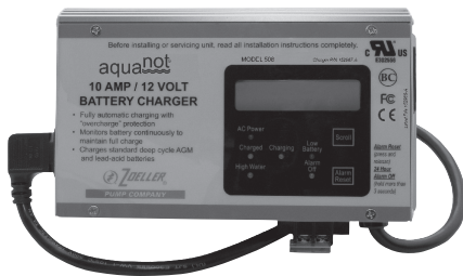
Model 508 Controller

Minimum pit size: 18" (46 cm) diameter X 22" (56 cm) deep. Minimum battery requirements: deep-cycle, size 27, 175 minute reserve capacity.