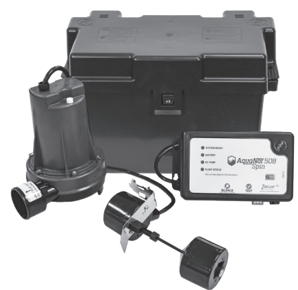
Aquanot® Spin 508 system

* If optional high water reed sensor is being used