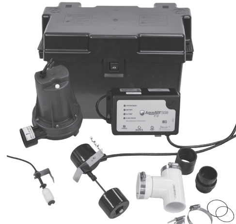
AquaNot® Fit 508 system