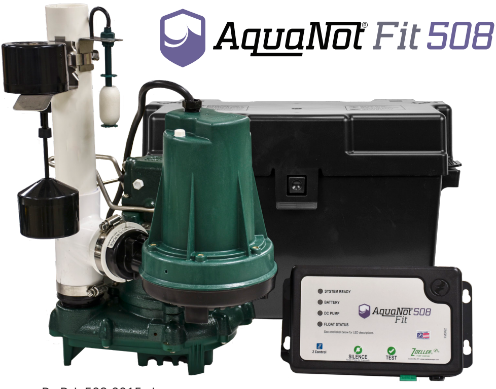
ProPak 508-0015 shown