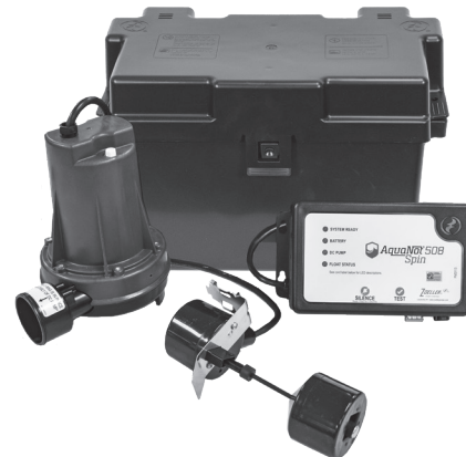
Aquanot® Spin 508 system

* If optional high water reed sensor is being used