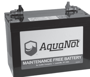
Aquanot® Deep-cycle Battery (purchase separately)