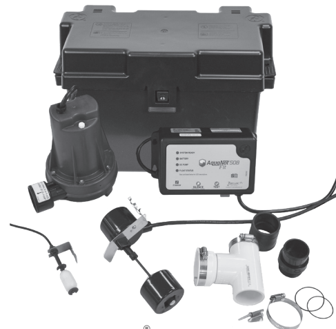
Aquanot® Fit 508 system