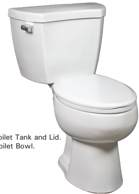
202-3003 Qwik Jon Toilet Tank and Lid. 202-3002 Elongated Toilet Bowl.