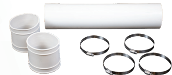
10-3050 Extension Kit For behind the wall installations