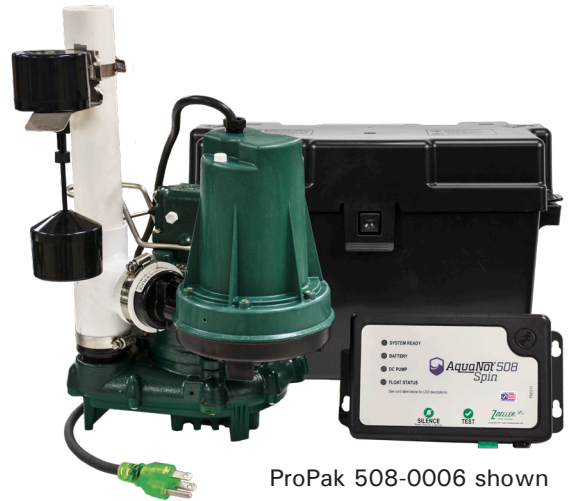
ProPak 508-0006 shown