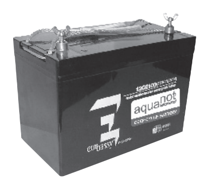
Aquanot<sup>®</sup> Deep-cycle Battery (purchase separately) P/N 10-1450 - AGM (shown) P/N 10-0761 - Wet

WARRANTY - 3 years from date of purchase.