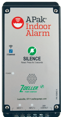
10-4014 APak® Z Control®

Consult factory for outdoor packages and other options.